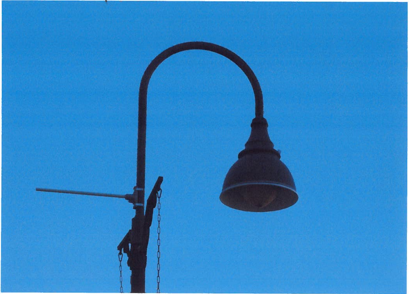
Bay Street Goose-Neck Fixture