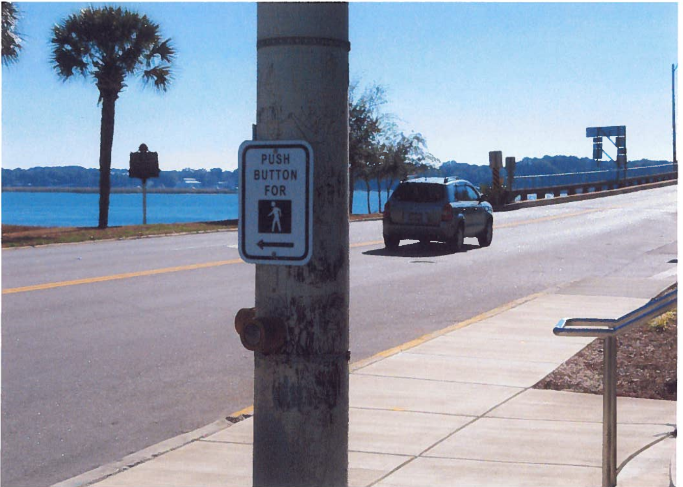
Pedestrian Push Button